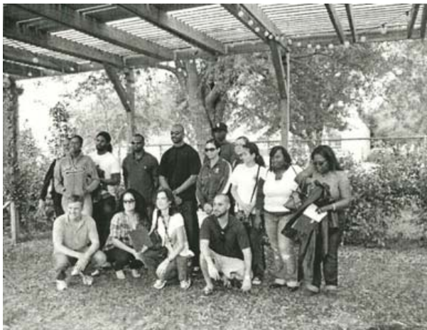
The Florida Theta chapter at Barry University presented a PowerPoint presentation at an on-campus conference called "Soulful Citizenship"